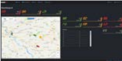
Vehicle Location Overview