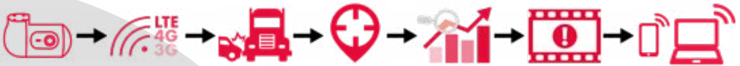
Fleet Overview Dashboard