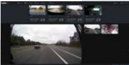
Driver Behavior Reports