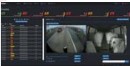
HD Video/Audio Playback