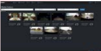
Video Events/Alerts Dashboard