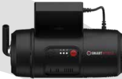
Rear View - Driver Facing